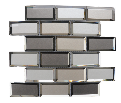
4x2 Beige Mix GLAMMBM42