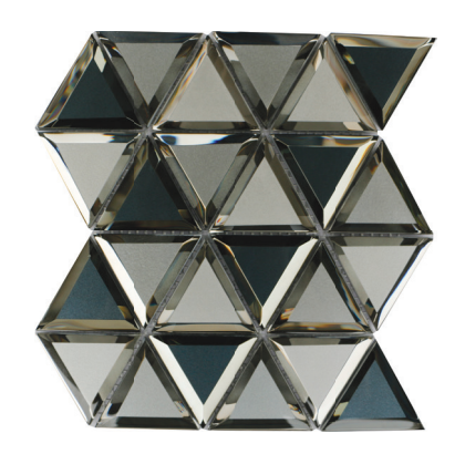
Triangle Grey Mix GLAMMGMTRI