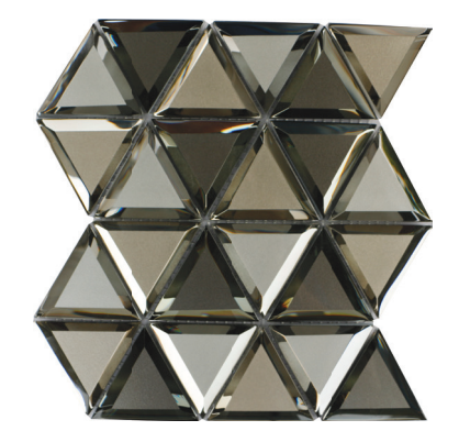
Triangle Beige Mix GLAMMBMTRI