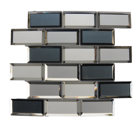
4x2 Grey Mix GLAMMGM42